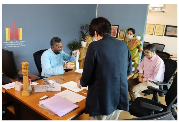
(Fig1: Meeting between IITH and JICA Project Team)

The meeting provided a good opportunity for all members to feel a high level of enthusiasm and commitment to the project and to confirm the sense of unity through the active exchange of views from both the Japanese and Indian sides.