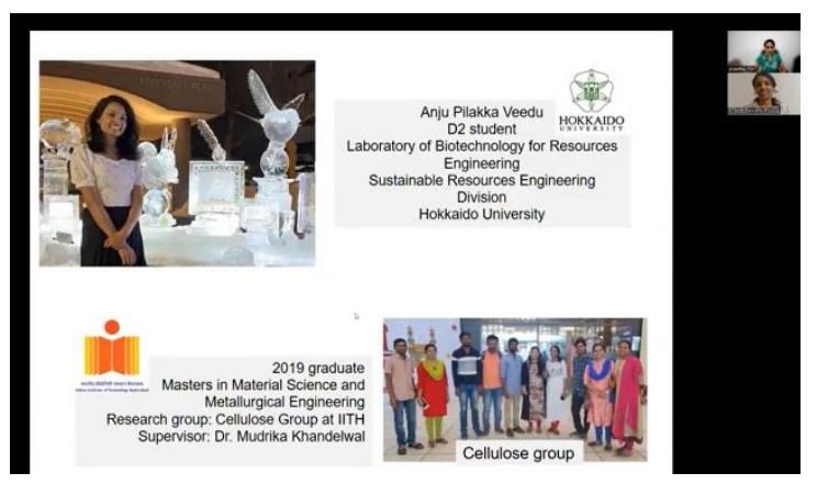
(Fig8: Senior scholar encourages IITH students)

The Japan Desk is publicizing information on the FRIENDSHIP 2.0 Scholarship Program on the portal site while receiving inquiries at any time