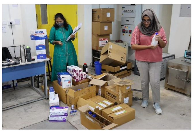
(Fig2: Procurement Audit by Japan Desk)