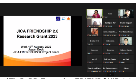
(Fig5: PR Event for FRIENDSHIP 2.0 Research Grant)

On 17<sup>th</sup> August, a PR event was held prior to the call for applications for the FRIENDSHIP Research Grant Program 2023 (2nd batch). The program provides grants to IITH faculty for joint research with Japanese academic institutions and Japanese companies in the fields of science and technology. The Research Grant program aims to promote India-Japan collaboration through activities such as co-supervising of IITH students, internships at Japanese companies, and seminars. More than 40 IITH faculty members participated in the event, which helped increase IITH faculty members' interest in joint research with Japan.