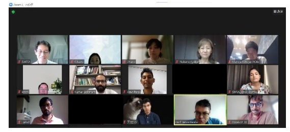
(Fig9: Online meetup event)

supervisors and discussion with their laboratory members. Many of graduates were able to use their experiences in Japan and the achievement of their research to pursue diverse career paths, such as doctoral programs in Japan or abroad, to become postdoctoral researchers in Japan or abroad, or to find employment with Japanese companies. Many graduates expressed their desire to share their experiences with IITH students interested in studying in Japan and to encourage them to do so. We hope that the graduates will continue to serve as a bridge for collaboration between IITH and Japan.