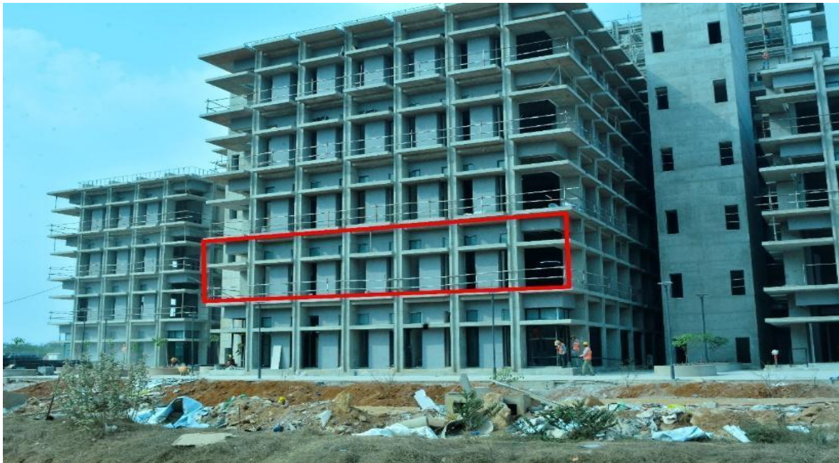
Figure 3-1: SIC Space Marked with Red